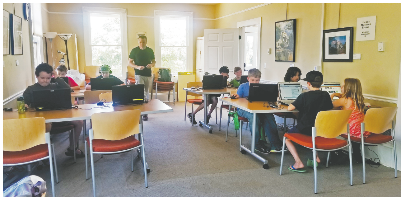
Code Campers at Port Townsend Library learn to use code-practice software to learn to write the computer code that operates everything from games to industrial machinery.

The program begins June 26 and kids will start off learning from a program called Scratch which Gage Pacifera, the main organizer of the program, said helps kids learn